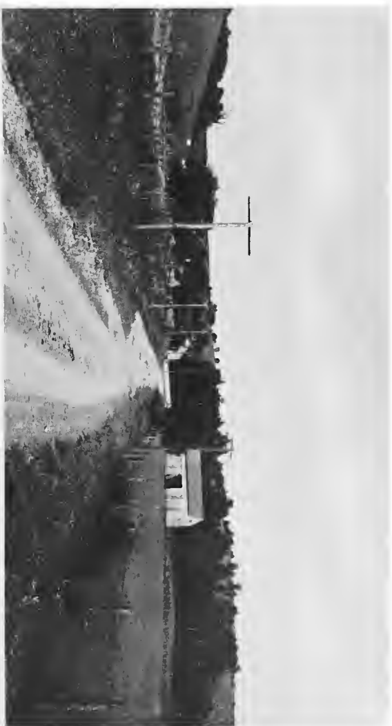
CEDAR CREEK BATTLEFIELD